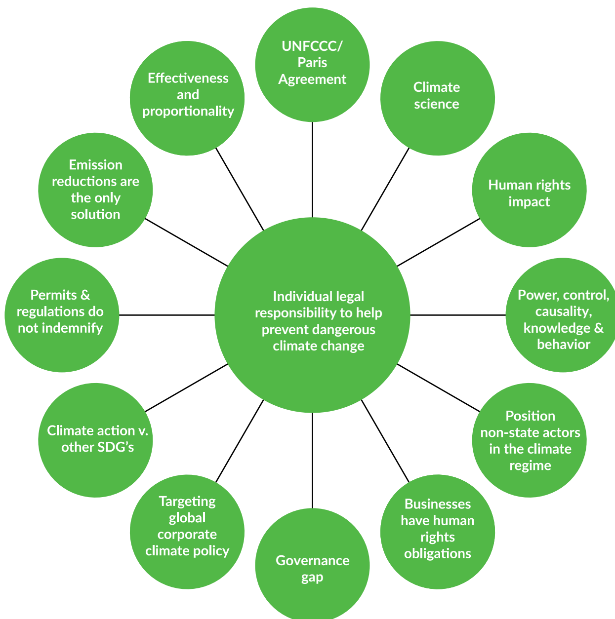
Figure 1 Key factual and legal ingredients of climate litigation

Below is a non-exhaustive overview of key factual and legal ingredients of a successful climate case, based on the strategy of the Shell case and updated with some recent developments. All these topics will be discussed in this memorandum. We note that all topics are interrelated and to some extent overlapping.